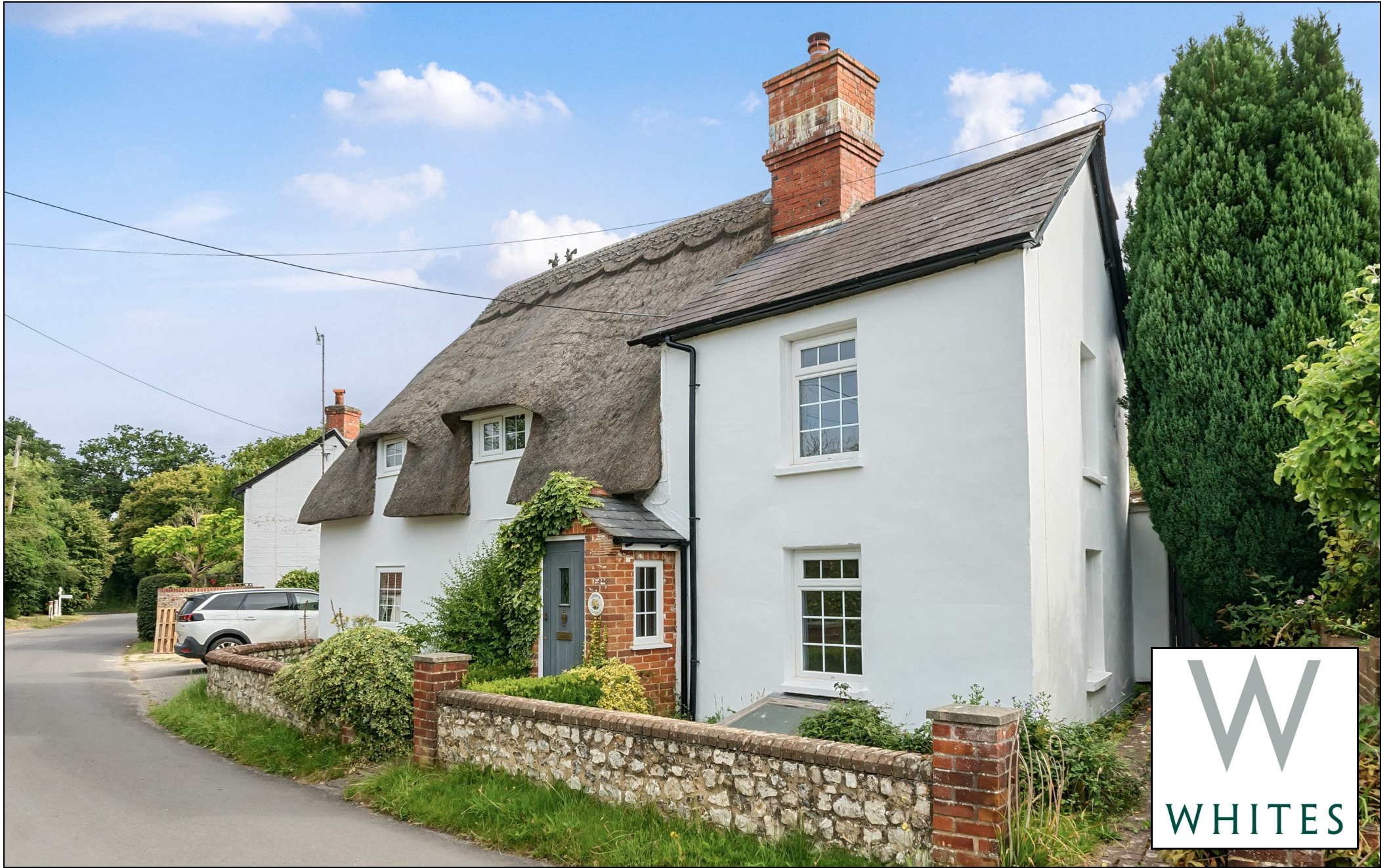
Cobweb Cottage, Netton, Salisbury, Wiltshire, SP4 6AW